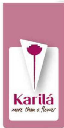
Product nr 3..1 Flower Cristal