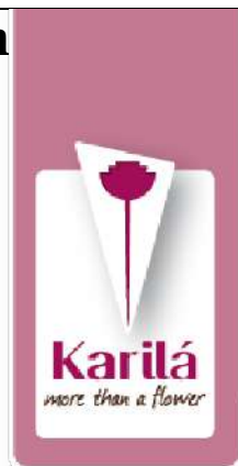
Product nr 2..4 Flower Water set