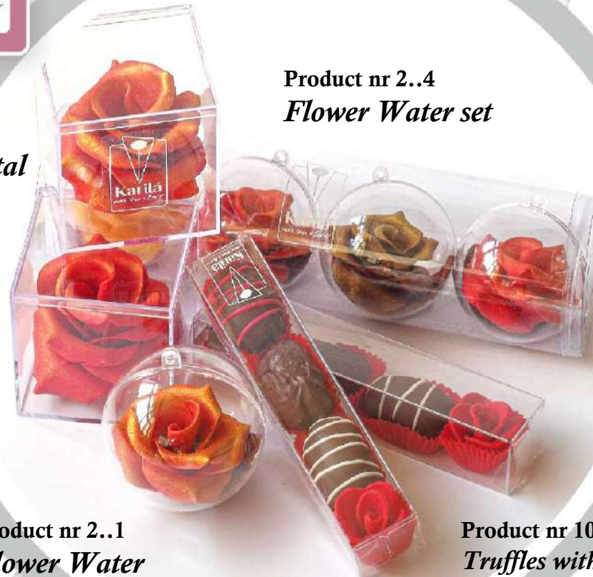
Product nr 10..1 Truffles with flower

More than a flower More than a chocolate