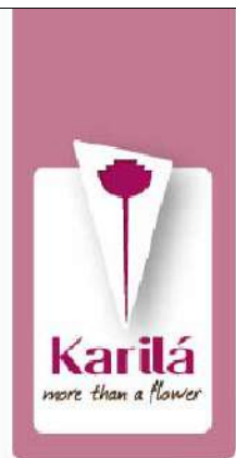
Product nr 3..1 Flower Cristal