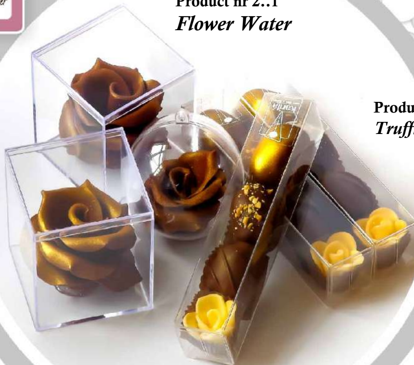
Product nr 10..1 Truffles with flower