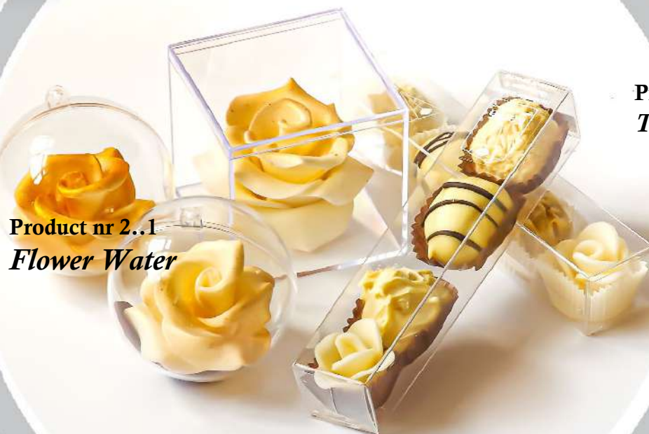
Product nr 2..1 Flower Water