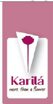
Product nr 3..1 Flower Cristal