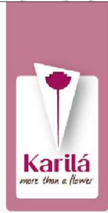
Product nr 3..1 Flower Cristal