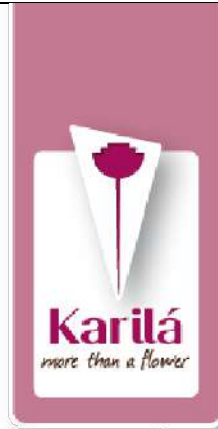
Product nr 2..4 Flower Water set