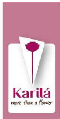
Product nr 2..4 Flower Water set