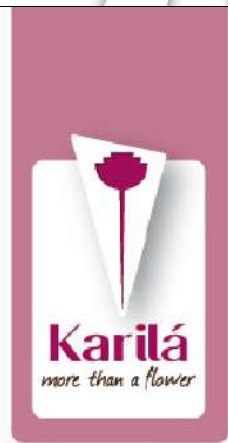
Product nr 3..1 Flower Cristal